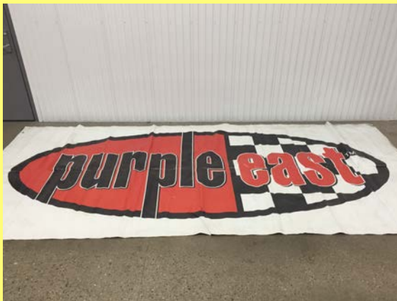
A "PurpleEast" banner is left over from the WMGP back in 1999. - It is printed on vinyl.

When we were cleaning out our race trailer and preparing it for winter storage, we came across a few items that we decided to pitch. Dayle Frame, our Competition Director, suggested that we offer the items to any of our members who would like them free of charge.