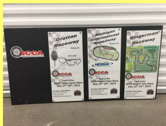
A corrugated plastic display panel is made for us by Danny Kellermeyer. - We used it at the 2013 MIAS.