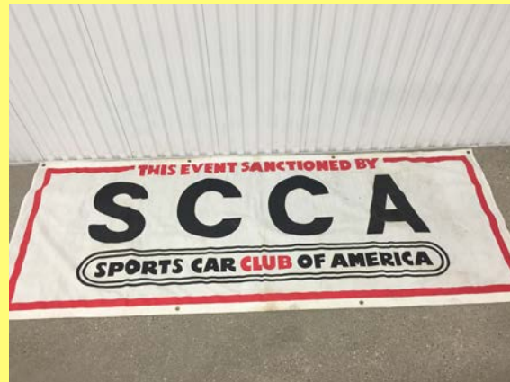
A cloth SCCA banner. - We have no idea where it came from.